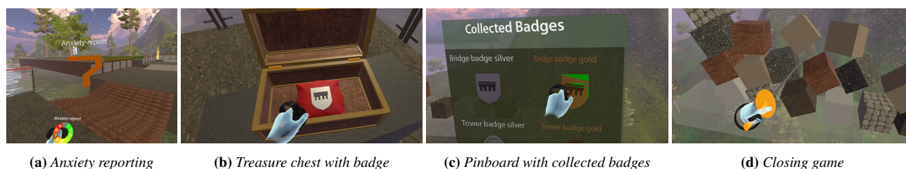
Figure 4: (a) Anxiety reporting function to indicate the current anxiety level. (b) chest with a badge inside used as a motivational element and (c) a pinboard as a progression measure. (d) Closing game at the end of the Tower Scenario.