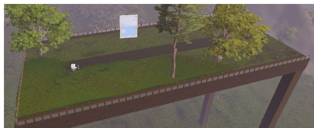
Figure 1: VE of the application where the tutorial takes place.

An initial area was designed as the starting point for every ET session. It is intended to create a safe atmosphere, but also to provide a glimpse into the VE and the exposure tasks ahead (see Figure 1). It is also the area where a tutorial takes place.